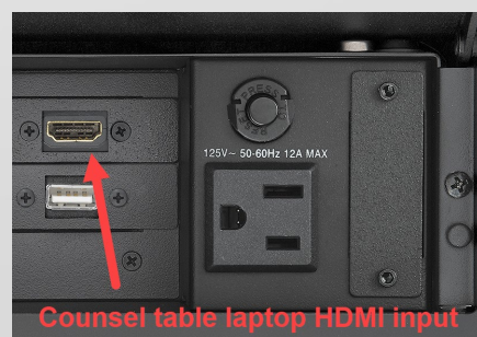
Counsel table laptop HDMI input