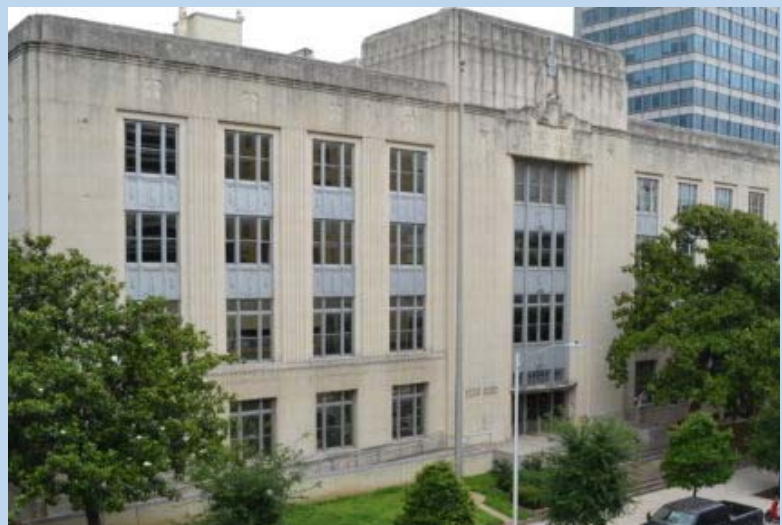
Historic Federal Courthouse