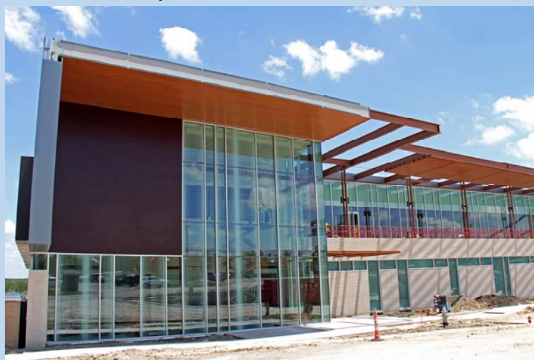
Medical Examiner's Facility