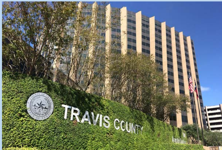
Main Administration Building

Travis County Planning and Budget Office