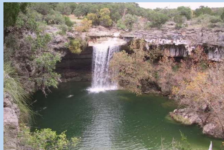
Hamilton Pool Preserve